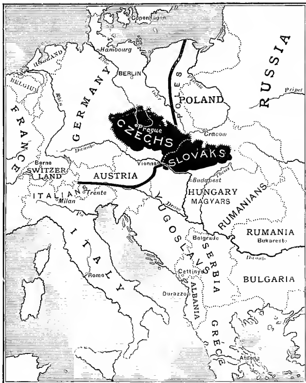
THE INTERNATIONAL POSITION OF THE CZECHO-SLOVAK REPUBLIC IN FUTURE EUROPE